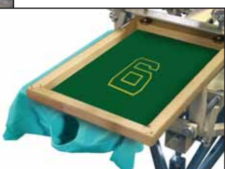
Print in sequential numbers, single and double digits, up to 99

The Digi-Tex holds two tiers of frames. While the lower tier consists of frames with the first color (such as the inside color of the number), the upper tier holds the frames with the second color (such as the outline of the number). Screens in the upper tier are lowered through spaces in the lower tier and print the second color in registration.