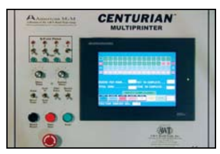
State-of-the-art PLC features online production and troubleshooting data.