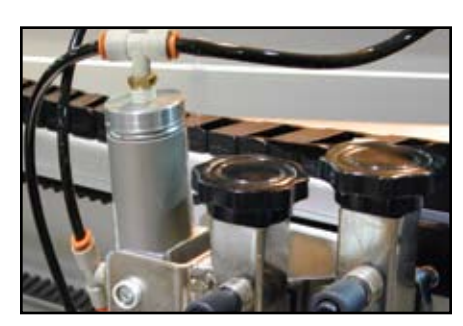
Pneumatic Squeegelizer™ automatically maintains uniform print pressure across the entire squeegee length and throughout the print stroke.